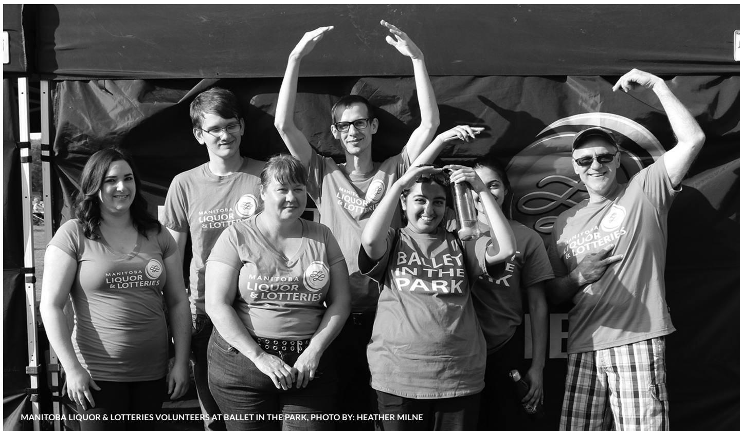
MANITOBA LIQUOR & LOTTERIES VOLUNTEERS AT BALLET IN THE PARK