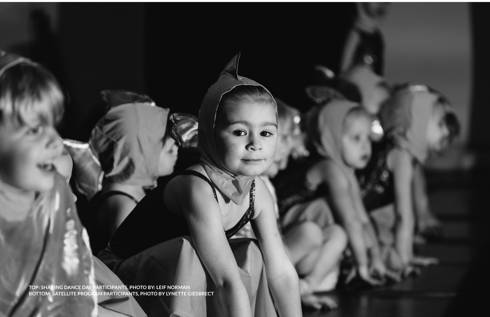
TOP: SHARING DANCE DAY PARTICIPANTS BOTTOM: SATELLITE PROGRAM PARTICIPANTS