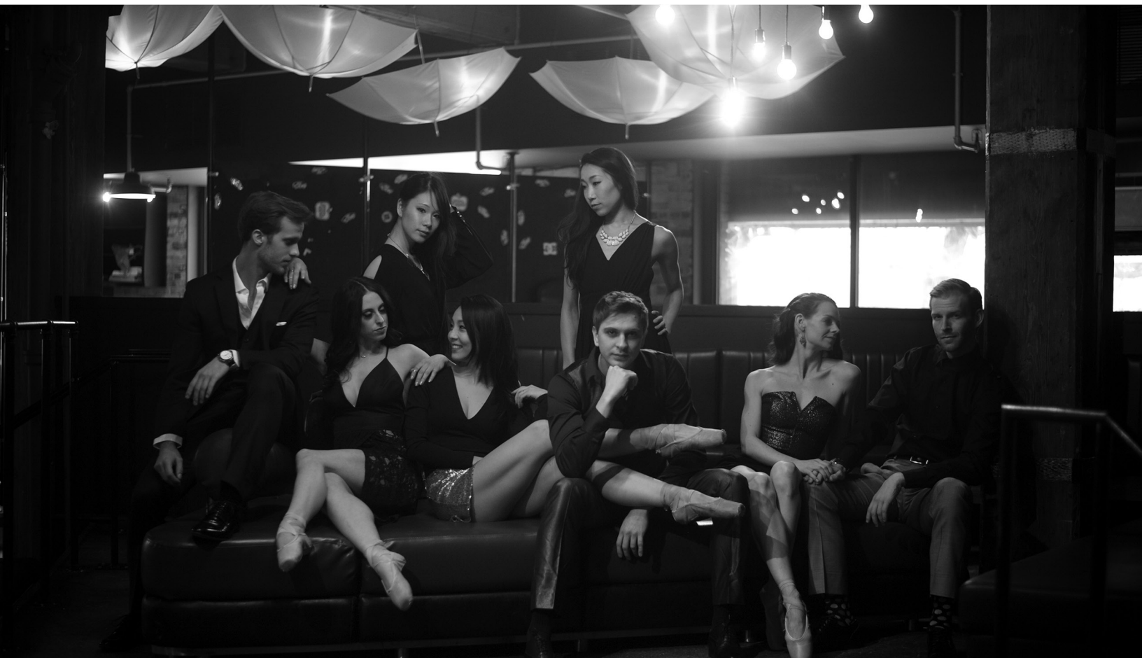
TOP LEFT: RWB BALLET BALL - HAVANA NIGHTS GUESTS BOTTOM LEFT: RWB COMPANY FOR BARRE AFTER HOURS TOP RIGHT: RWB PROFESSIONAL DIVISION STUDENTS DANCING AT THE RWB BALLET BALL - HAVANA NIGHTS