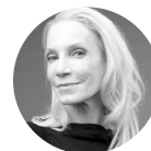
Evelyn Hart Guest Dancer

This season the RWB delighted in having the iconic Evelyn Hart return to the stage with the Company for the world premiere of James Kudelka's Vespers .