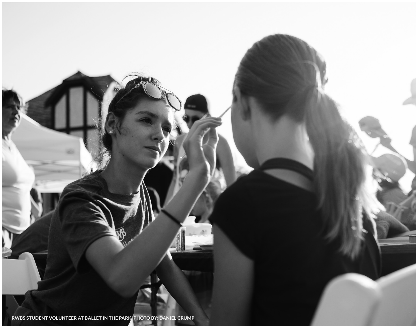
RWBS STUDENT VOLUNTEER AT BALLET IN THE PARK