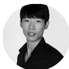
Yue Shi Corps de Ballet